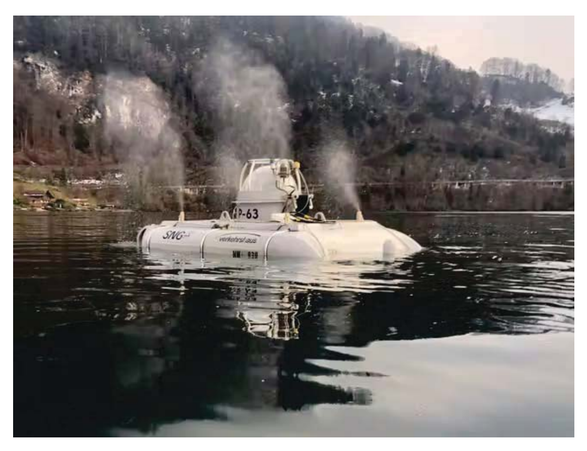
Explorers can plunge the depths in the 'Subspirit'

Reproduced by Gorkana under licence from the NLA (newspapers), CLA (magazines), FT (Financial Times/ft.com) or other copyright owner. No further copying (including printing of digital cuttings), digital reproduction/forwarding of the cutting is permitted except under licence from the copyright owner. All FT content is copyright The Financial Times Ltd.