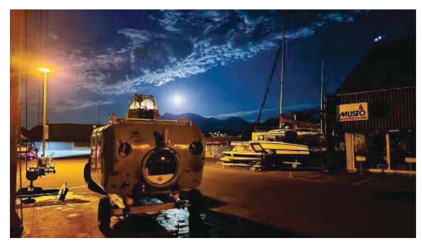
'Subspirit' is effectively an environmental research satellite and aquatic classroom