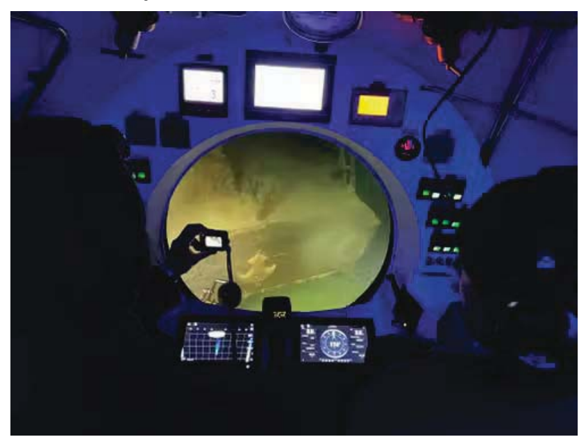
Submariners discover the 'Motor-Naue Portland'

Reproduced by Gorkana under licence from the NLA (newspapers), CLA (magazines), FT (Financial Times/ft.com) or other copyright owner. No further copying (including printing of digital cuttings), digital reproduction/forwarding of the cutting is permitted except under licence from the copyright owner. All FT content is copyright The Financial Times Ltd.